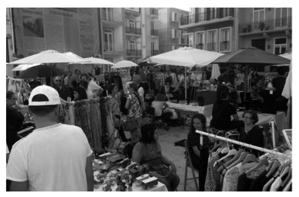
Figure 5 – Urban markets in Oporto city centre