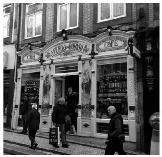
Figure 3 – Old and new economic activity establishments in Oporto city centre

When asked what kind of support municipality could give to contribute to the development of their business in particular and the economic activity of the city centre in general, the most mentioned aspects respondents refer are the financial support, particularly for the rehabilitation of buildings, that in many cases are very degraded and thus unattractive at the outside; the availability of free parking or parking at more affordable prices than those currently practiced; the bureaucratic simplification and the increased security on the streets. It should be noted that four of the respondents mentioned that whenever contacted municipality requesting support it has been demonstrated willingness to collaborate and there was in fact effective support by the municipality of Oporto.