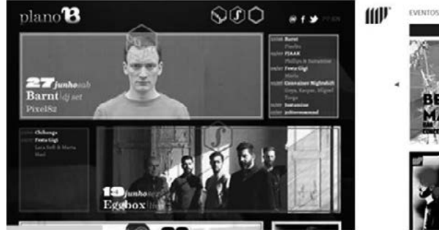
Figure 4 – Homepage of internet pages of bars / nightclubs with cultural activities