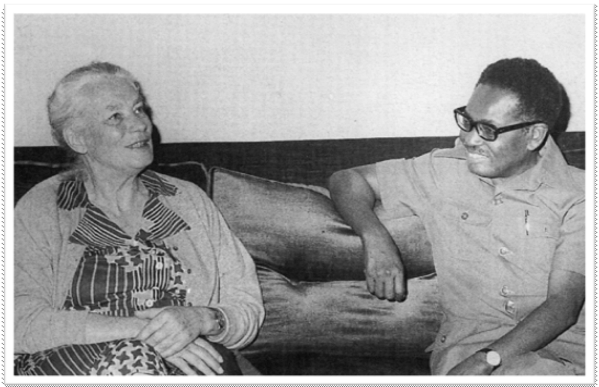
Figure 2 – Joyce Lussu and Agostinho Neto in Luanda, 1976